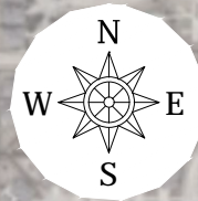
EXHIBIT B (1 of 2) INFRASTRUCTURE SCOPE