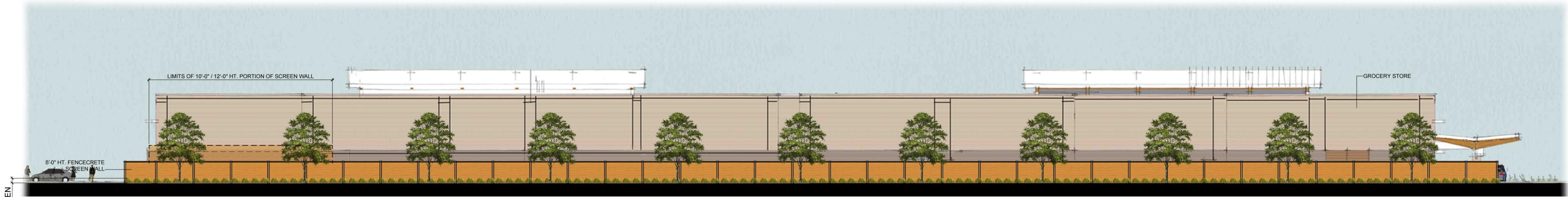
SCREEN WALL ELEVATION FROM MAIN STREET NTS