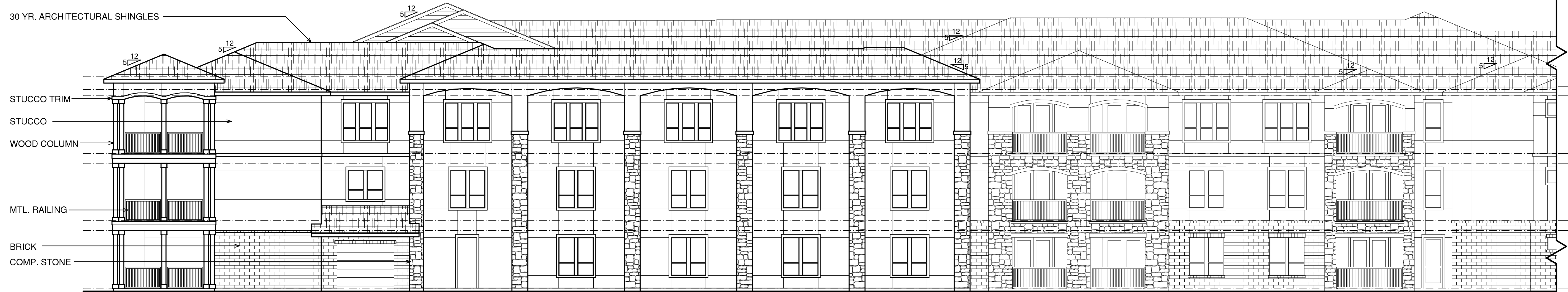
2 BUILDING A - SIDE ELEVATION SCALE 1/8"=1'-0"