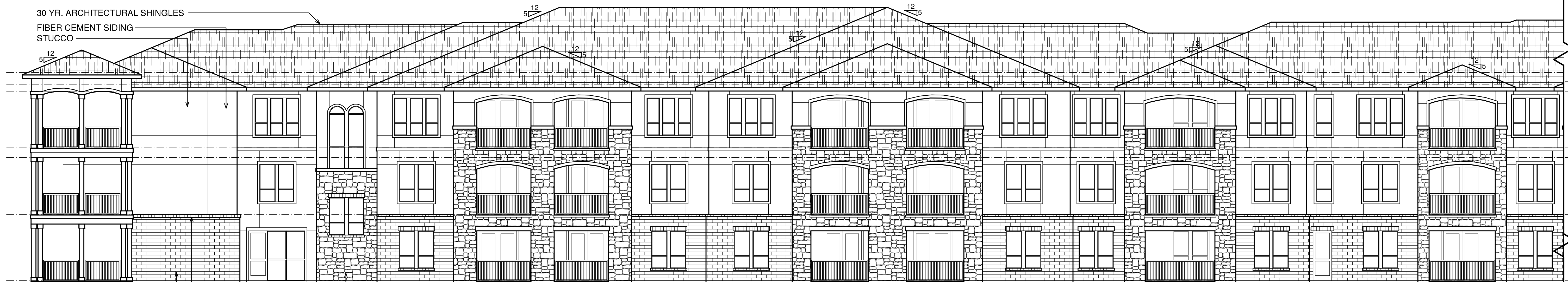
2 BUILDING A - SIDE ELEVATION SCALE 1/8"=1'-0"