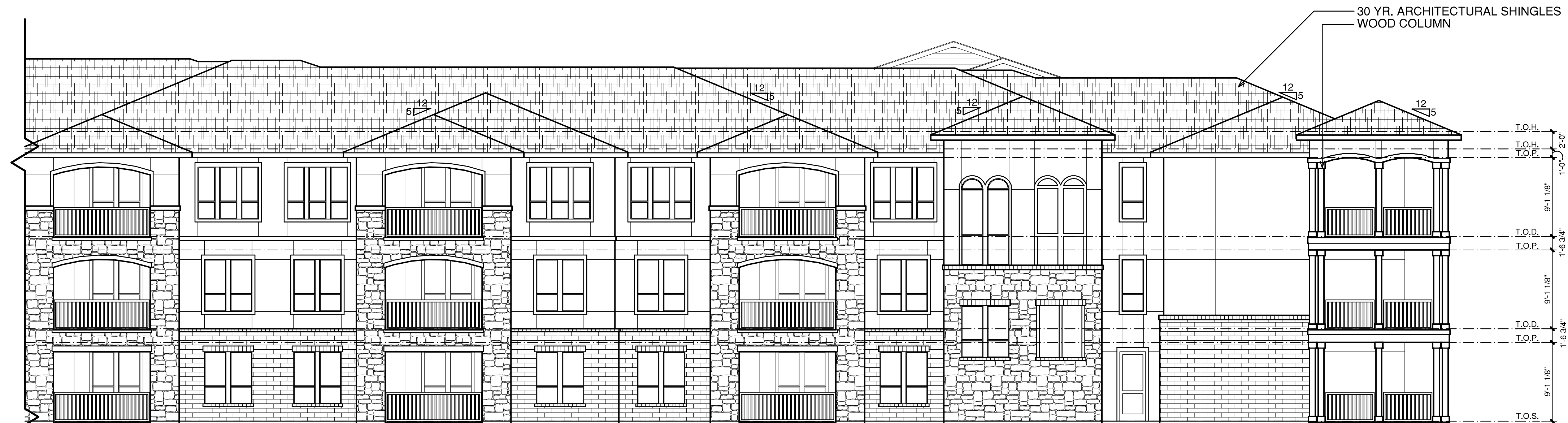
1 BUILDING A - SIDE ELEVATION SCALE 1/8"=1'-0"