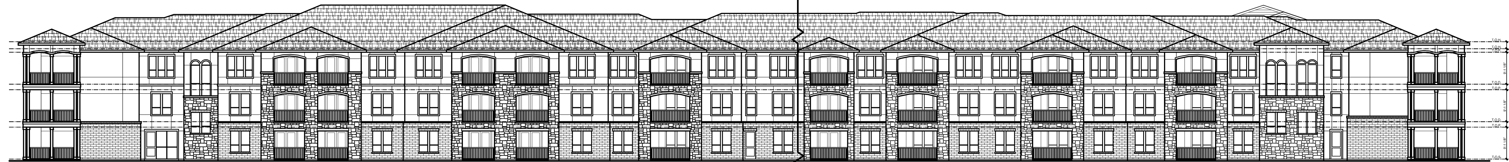
3 BUILDING A - OVERALL SIDE ELEVATION SCALE 1/8"=1'-0"