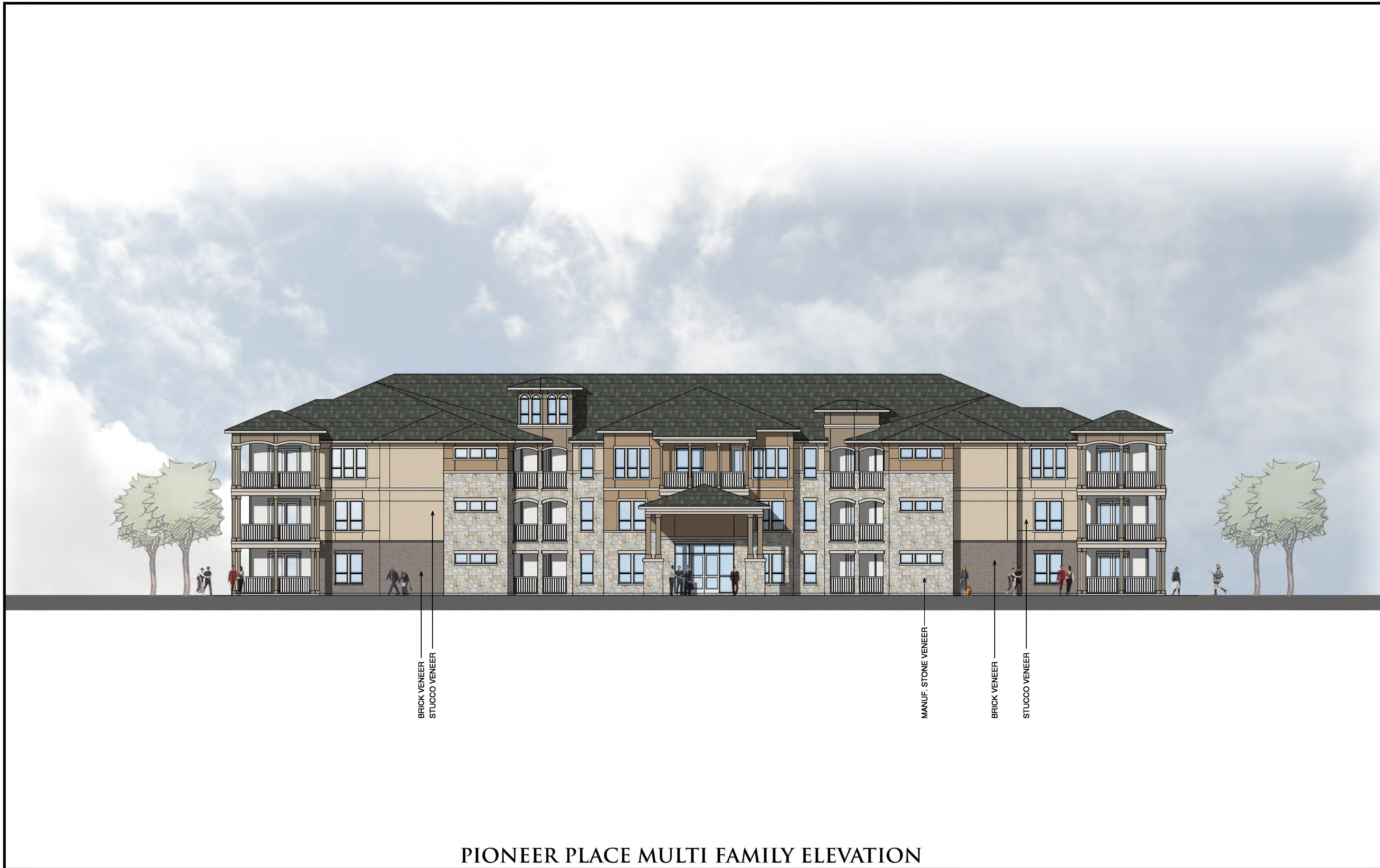
PIONEER PLACE MULTI FAMILY ELEVATION MANSFIELD, TEXAS