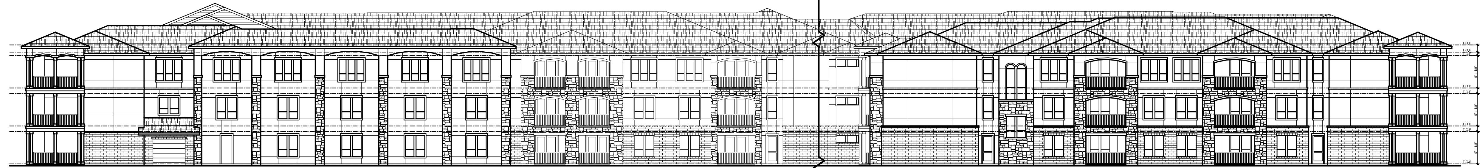
3 BUILDING A - OVERALL SIDE ELEVATION SCALE 1/8"=1'-0"