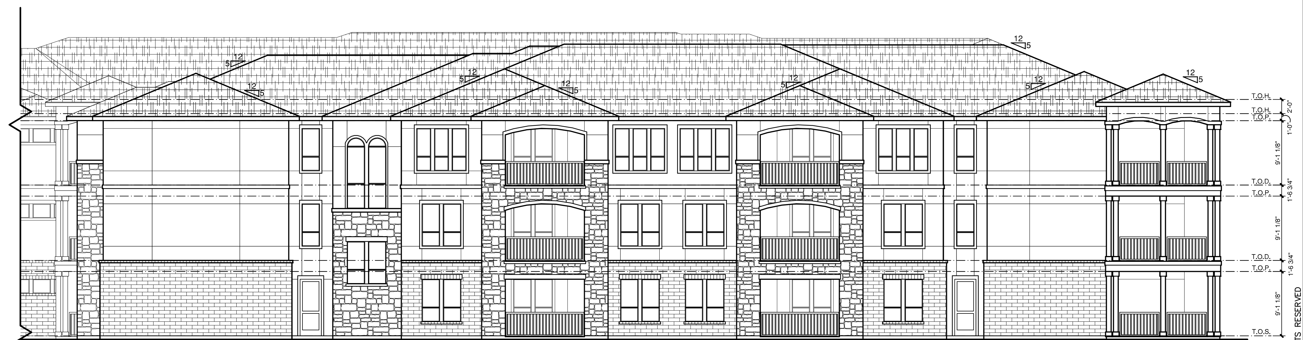
1 BUILDING A - SIDE ELEVATION SCALE 1/8"=1'-0"