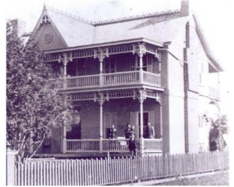
Mansfield Co-ed College (Currently Blessing Funeral Home – completely different facade)