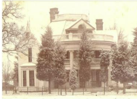
Julian Feild House