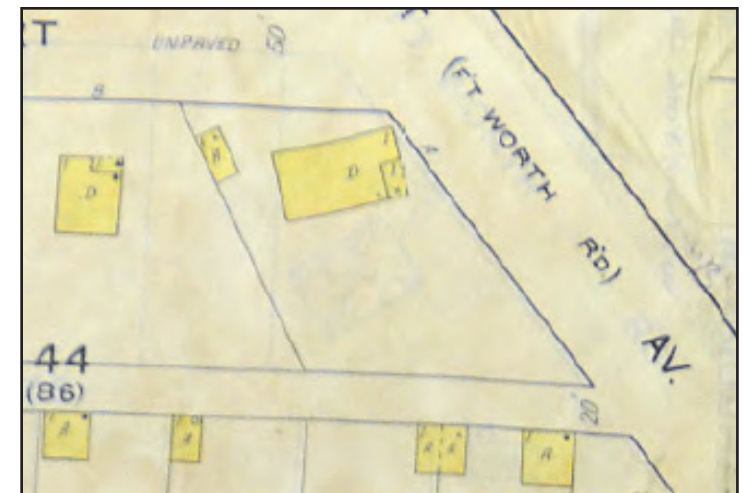
1933 Sanborn Insurance Map showing the 1925 bungalow at 205 North Street. The new house was closer to Van Worth Street and had a porch on the left side of the front façade that is still there today.