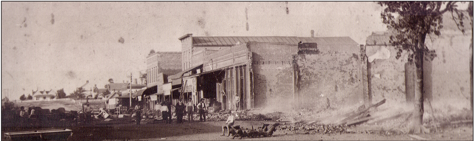
VIEW OF MAIN STREET AFTER THE 1901 FIRE. THE MAHONEY BUILDING IS THE FIRST UNDAMAGED BUILDING.

The building is a registered Mansfield Historic Landmark.