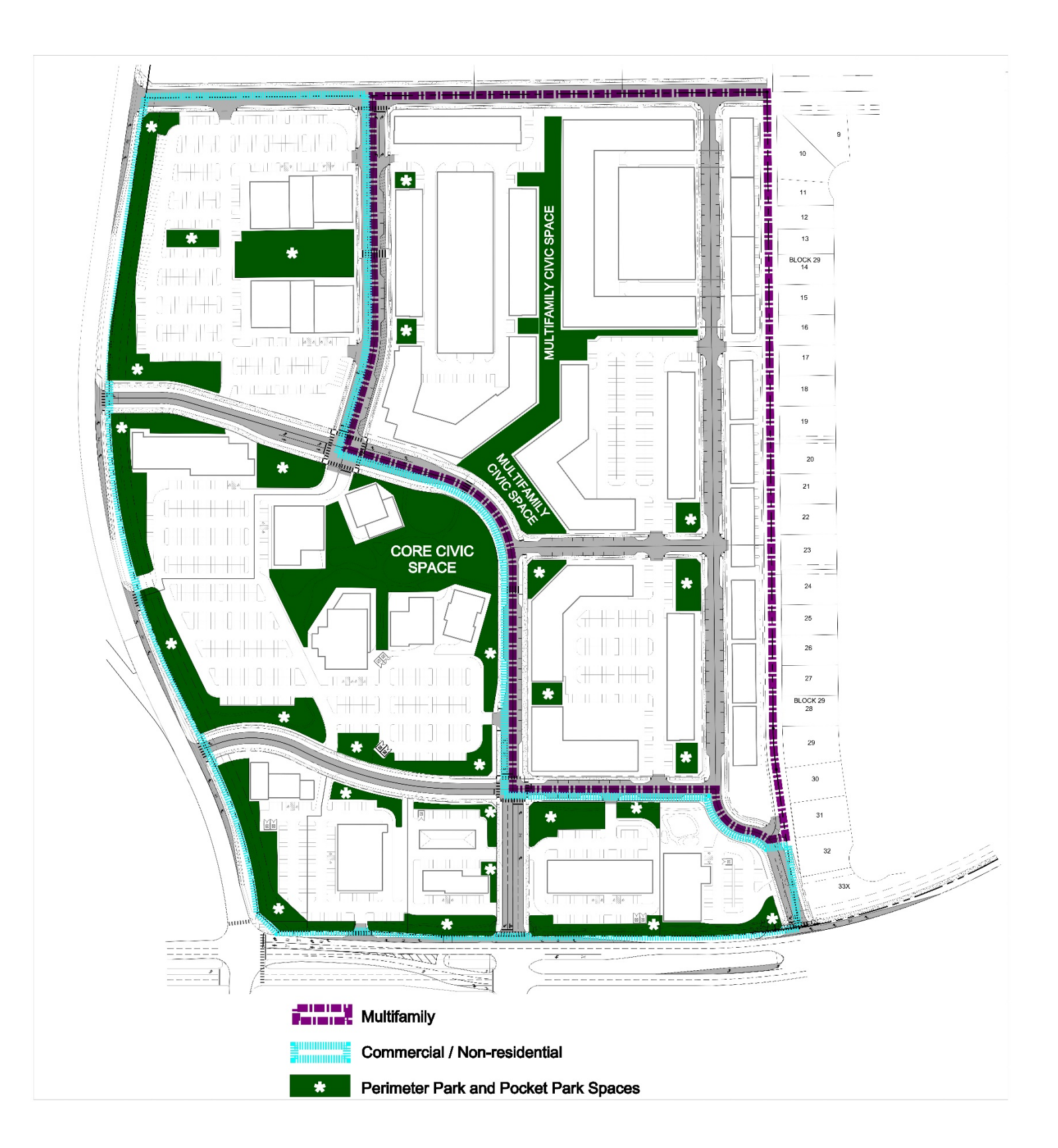
EXHIBIT "B" – Concept Plan