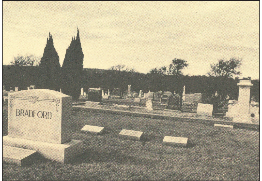
Photograph of the Mansfield Cemetery