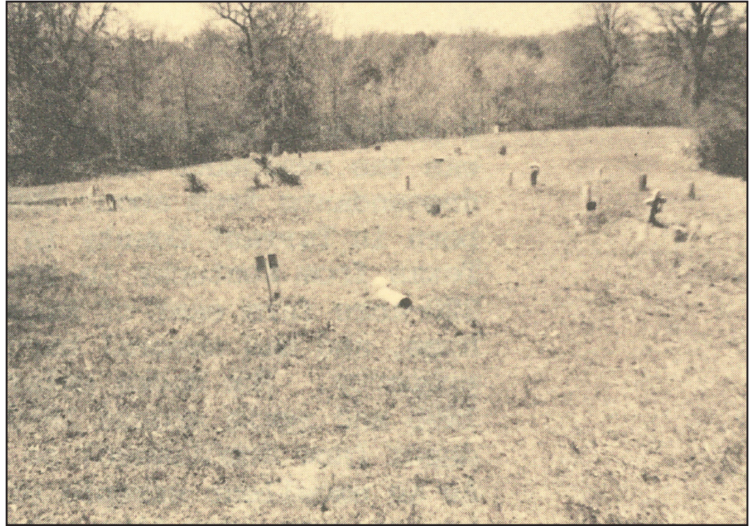
Photograph of the Mansfield Community Cemetery

The Mansfield Community Cemetery, together with the