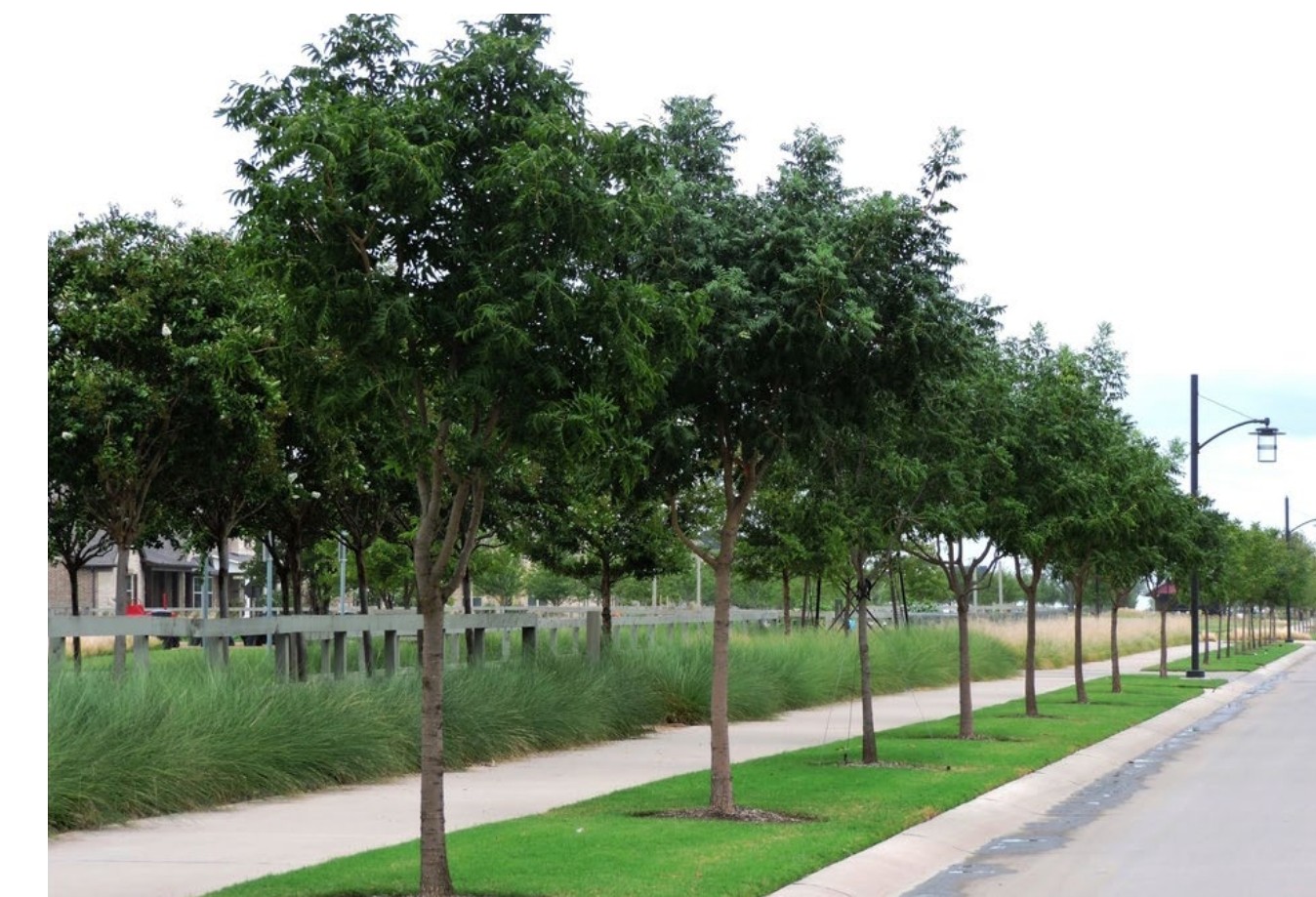
STREET TREE PLANTING