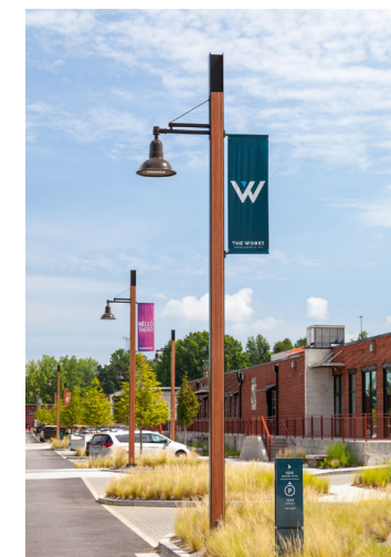
DECORATIVE STREET LIGHTING