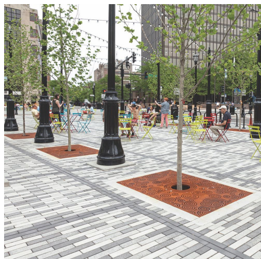
DECORATIVE PAVERS/SITE FURNISHING