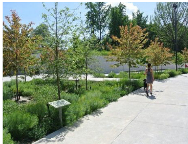
BIO RETENTION/RAIN GARDEN