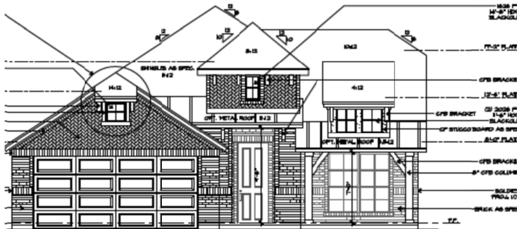
1 | Front Elevation "B" - Base

In the second example, the front entryway encroaches over the Build-To Line. Mill Valley does not have a porch zone to accommodate these type of encroachments.