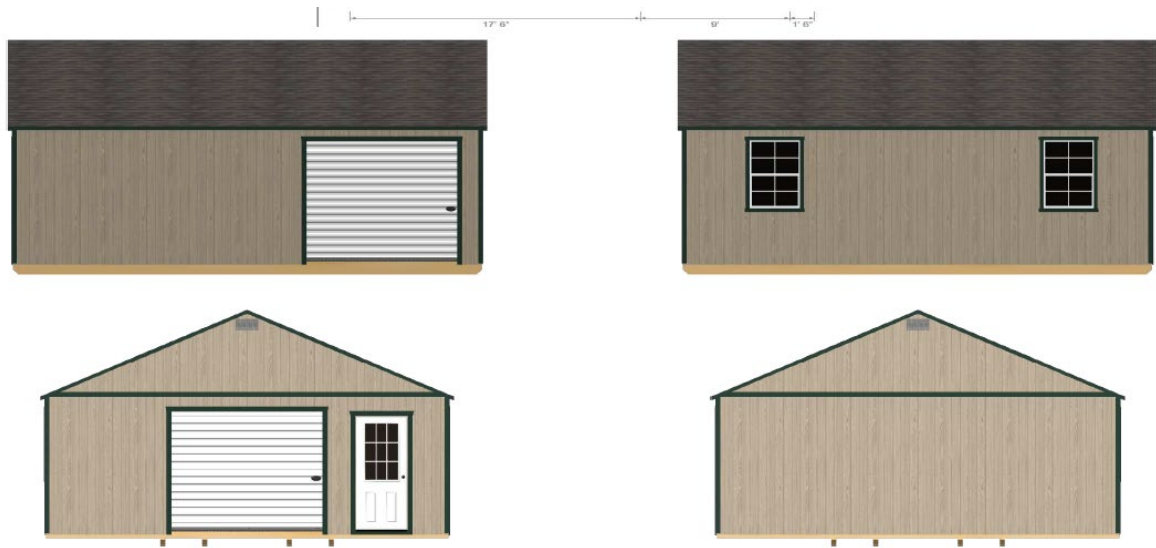
Elevations of building for which special exception is being requested