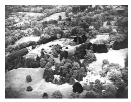
The landscape of Lyndhurst, Tarrytown, New York, is significant in American culture and work of a master gardener, Ferdinand Mangold.

It is during this step that the historic significance of the landscape component of a historic property and its integrity are determined. Historic significance is the recognized importance a property displays when it has been evaluated, including when it has been found to meet National Register Criteria. A landscape may have several areas of historical significance. An understanding of the landscape as a continuum through history is critical in assessing its cultural and historic value. In order for the landscape to have integrity, these character-defining features or qualities that contribute to its significance must be present.