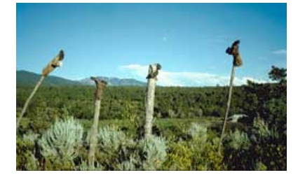
The "Boot Fence," near D.H. Lawrence Ranch, Questa, New Mexico, is an example of a character-defining landscape feature.

Today, those involved in preservation planning and management of cultural landscapes represent a broad array of academic backgrounds,training, and related project experience. Professionals may have expertise in landscape architecture, history,