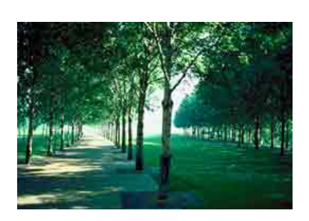
Another example of a very different landscape feature is this tree planting detail for Jefferson Memorial Park, St. Louis, Missouri.

Nearly all designed and vernacular landscapes evolve from, or are often dependent on, natural resources. It is these interconnected systems of land, air and water, vegetation and wildlife which have dynamic qualities that differentiate cultural landscapes from other cultural resources, such as historic structures. Thus, their documentation, treatment, and ongoing management require a comprehensive, multi-disciplinary approach.