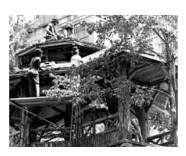
Central Park has developed an in-house historic preservation crew to undertake small projects. A specialized crew has been trained to repair and rebuild rustic furnishings.

The philosophical approach to maintenance should coincide with the landscape's current stage in the preservation planning process. A Cultural Landscape Report and Treatment Plan can take several years to complete, yet during this time managers and property owners will likely need to address immediate issues related to the decline, wear, decay, or damage of landscape features. Therefore, initial maintenance operations may focus on the stabilization and protection of all landscape features to provide temporary, often emergency measures to prevent deterioration, failure, or loss, without altering the site's existing character.