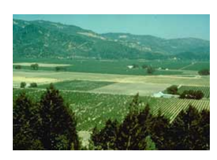
Patterns on the land have been preserved through the continuation of traditional uses, such as the grape fields at the Sterling Vineyards in Calistoga, California.

Cultural landscapes can range from thousands of acres of rural tracts of land to a small homestead with a front yard of less than one acre. Like historic buildings and districts, these special places reveal aspects of our country's origins and development through their form and features and the ways they were used. Cultural landscapes also reveal much about our evolving relationship withthe natural world.