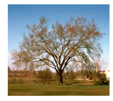
When the American Elm was plagued with Dutch Elm Disease, many historic properties relied on the Japanese Zelkova as a substitute plant (see below).

For all treatments, the landscape's existing conditions and its ability to convey historic significance should be carefully considered. For example, the life work, design philosophy and extant legacy of an individual designer should all be understood for a designed landscape, such as an estate, prior to treatment selection. For a vernacular landscape, such as a battlefield containing a largely intact mid-nineteenth century family farm, the uniqueness of that agrarian complex within a local, regional, state, and national context should be considered in selecting a treatment.