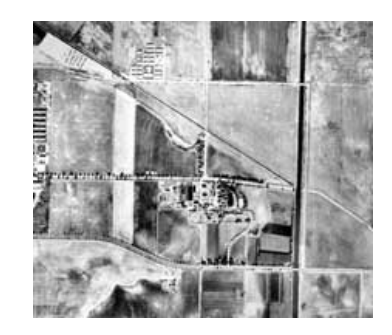
Understanding the geographic context should be part of the inventory process. This aerial photograph at Rancho Los Alamitos, Long Beach, CA, was taken in 1936. (See, below.)

These are most often influenced by the timetable, budget, project scope, and the purpose of the inventory and, depending on the physical qualities of the property, its scale, detail, and the interrelationship between natural and cultural resources.