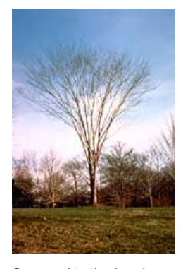
Compared to the American Elm (above right), it is readily apparent that the form and scale of this tree is really quite different, and

Reconstruction is defined as the act or process of depicting, by means of new construction, the form, features, and detailing of a non-surviving site, landscape, building, structure, or object for the purpose of replicating its appearance at a specific period of time and in its historic location.