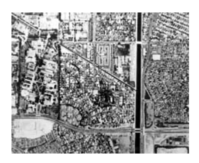
This present-day view of Rancho Los Alamitos shows present-day encroachments and adjacent developments that will affect the future treatment of visual and spatial relationships.

Although there are several ways to inventory and document a landscape, the goal is to create a baseline from a detailed record of the landscape and its features as they exist at the present (considering seasonal variations). Each landscape inventory should address issues of boundary delineation, documentation methodologies and techniques, the limitations of the inventory, and the scope of inventory efforts.