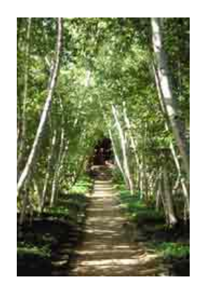
Hywet Hall, Akron, Ohio, which had suffered from borer infestation and leaf miner, was preserved through a series of carefully executed steps that took 15 years to realize

In rare cases, when evidence is sufficient to avoid conjecture, and no other property exists that can adequately explain a certain period of history, reconstruction may be utilized to depict a vanished landscape. The accuracy of this work is critical. In cases where topography and the