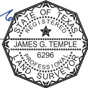
EXHIBIT PREPARED BY