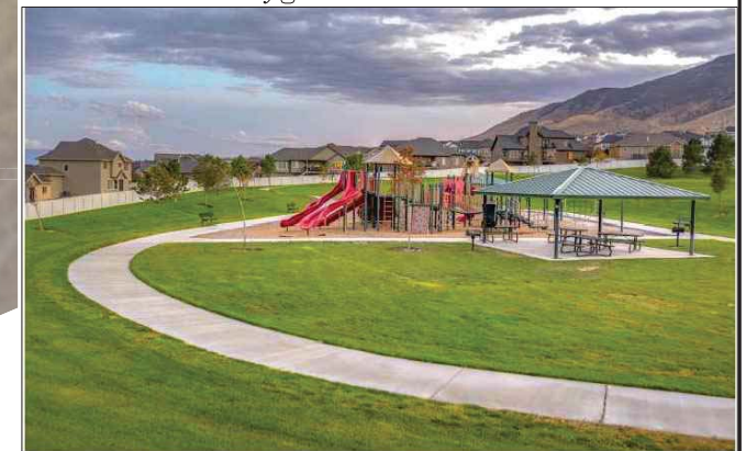
DETAIL 'C' Playground & Pavillion

EXHIBIT D ZC#21-010 OPEN SPACE TRAIL & SCREENING PLAN BIRDSONG WEST 55.899 ACRES SITUATED IN THE 197 RESIDENTIAL LOTS & 9 OPEN SPACE LOTS A. BEDFORD SURVEY, ABSTRACT No. 60 CITY OF MANSFIELD, JOHNSON COUNTY, TEXAS